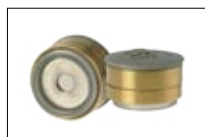
fast oxygen sensor

The unique constant high quality and long life guarantee of our Oxygen Sensors make this product range high appreciated by our customers world wide.