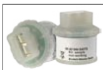
oxygen sensor with data memory chip